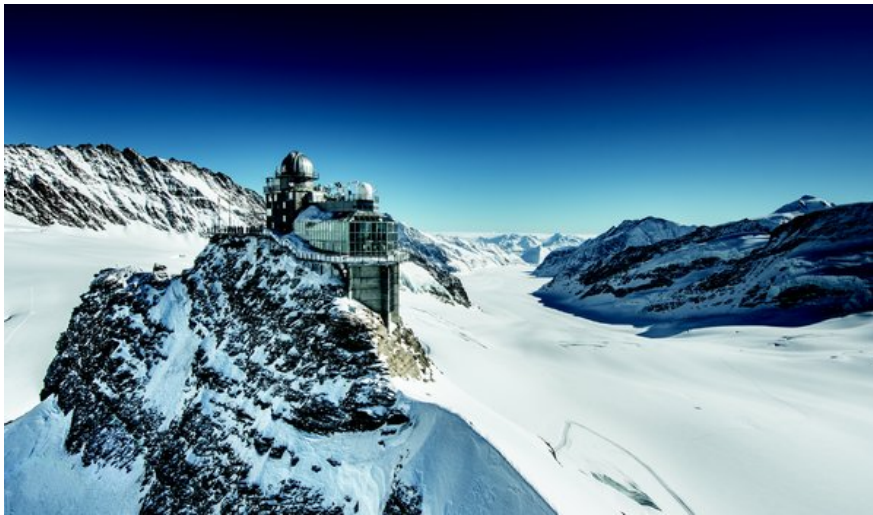
Sphinx and Aletsch Glacier

The Jungfrau Railway Group is a leading tourism company and the largest mountain railway company in Switzerland. The main offer is the journey to the Jungfraujoch – Top of Europe. Due to the long-term development of a distribution and agency network, it has achieved a leading position in the Asian markets. The Jungfrau Railway Group also offers trips to the famous Jungfrau region experience mountains and a range of winter sports. It also operates its own hydroelectric power station, leases premises for restaurants and operates and leases shops.