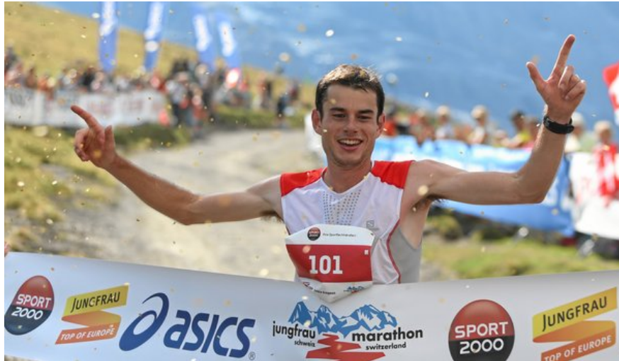
Jungfrau Railways' sponsorship of the Jungfrau Marathon

Jungfrau Railways is the official partner of the International Lauberhorn Ski Races. A new cooperation agreement was signed in 2014 between Lauberhorn Organising Committee, Jungfrau Railways and the Jungfrau Ski Region. The contractually assured mutual benefits in kind amount to CHF 1.8 million and are offset to the same extent. They mainly concern the areas of transport and advertising. Worldwide broadcasting has given the Lauberhorn Ski Races an important value for winter sports in the Jungfrau region. Regarding the transport services provided, the International Lauberhorn Ski Races are the biggest event for Jungfrau Railways. Some 1,946 tonnes of material were transported by the Wengernalp Railway for the Lauberhorn Ski Races in 2016.