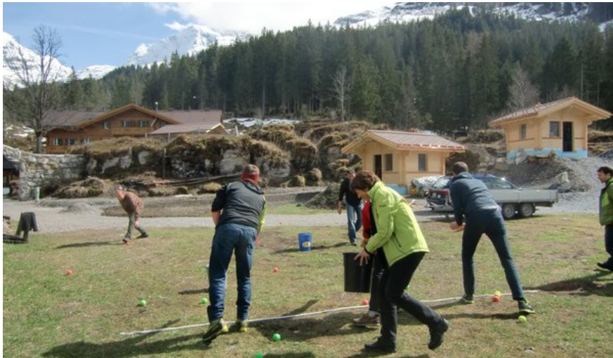
Leadership seminar Griesalp 2016