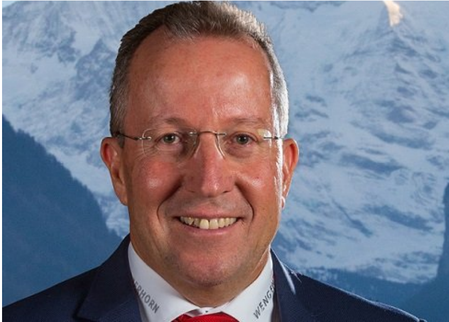
President of the Organising Committee, International Lauberhorn Ski Races

The railway not only transports materials but also the spectators. A Lauberhorn ticket on race days includes unlimited travel on the railway lines from Interlaken Ost via Lauterbrunnen and Grindelwald to Kleine Scheidegg as well as on the Innerwengen chairlift. Skiers can buy combi ski passes for one or two days. Holders of a Sportpass for the Jungfrau Ski Region will receive admission to the Lauberhorn race at a special rate. For children up to 15 years, a visit to the event is free when accompanied by a paying adult. They will also receive a free ski pass.