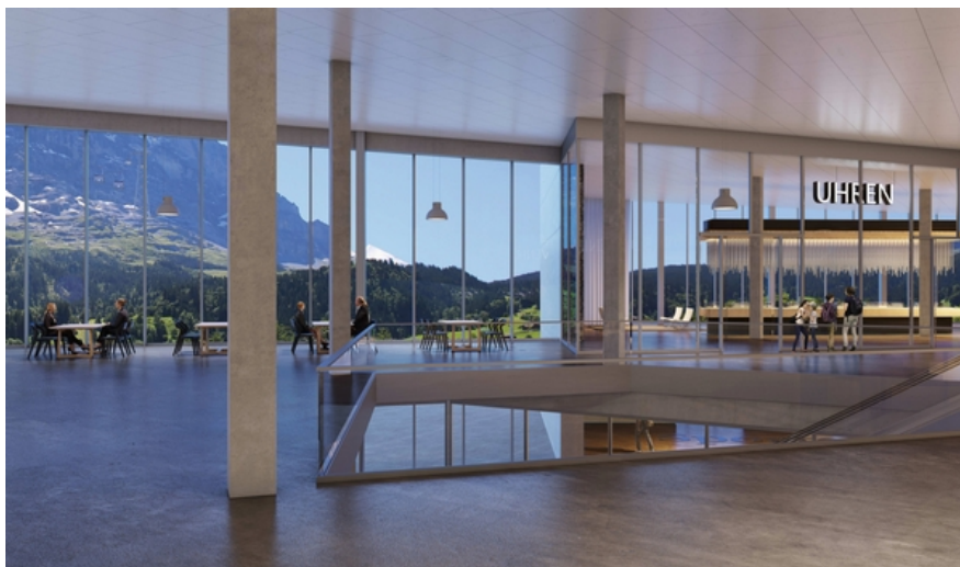
Shopping shortly before riding the Eiger Express