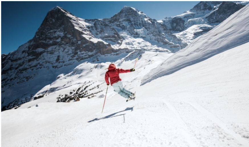
Skiing in front of Eiger, Mönch and Jungfrau

From Grindelwald Terminal, the Eiger Glacier station and the ski slopes can be reached in just 15 minutes. Thanks to the rapid return transport by the tricable gondola Eigerexpress to the mountain, the attractive valley runs can be used multiple times. The ski shuttle from the Grindelwald Terminal to the First Railway provides a direct bus connection between the two ski areas, making Grindelwald much more attractive as a ski holiday destination.