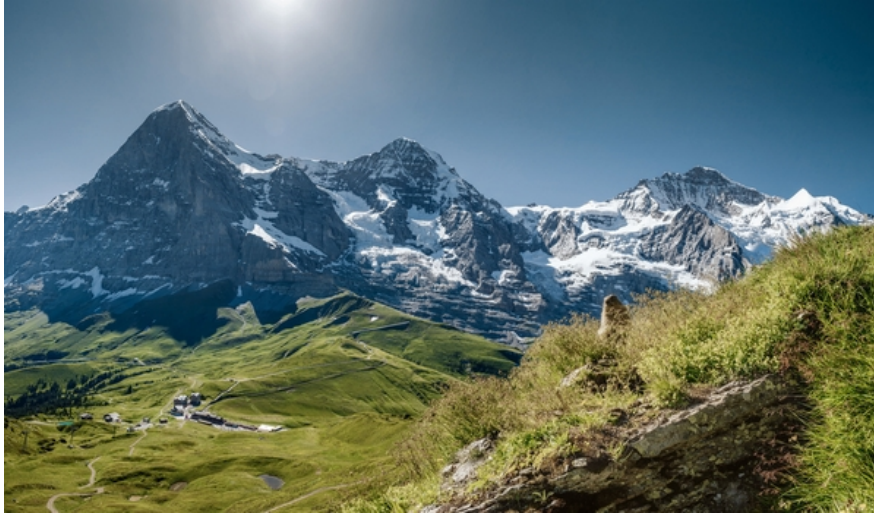
Kleine Scheidegg – Meeting point of the Alps

Kleine Scheidegg is relieved of people travelling to the Jungfraujoch and is therefore more attractive for excursion guests and hikers. It becomes the meeting place of the Alps.